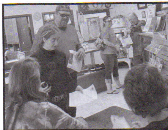
Bikers check in to pick up their card during their stop on the Knights on Bikes Love Run