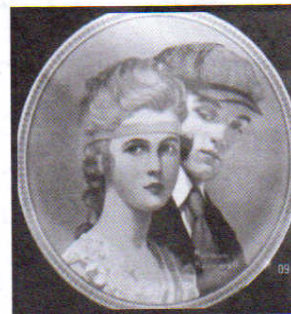
A sampling of the "Rediscovered Women Collection" plates donated by Rosemary Shriver.