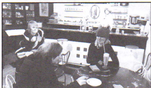
If only the sodas were real!

Crescent Girl Scout Troop 738 took advantage of Frontier Country Museum's free admission in December to hold their weekly meeting at the museum. We were delighted to welcome the scout troop and we hope to have them visit again soon.