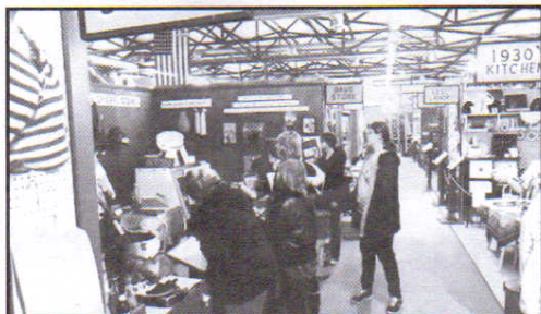
Girl scouts check out exhibits inside the museum.