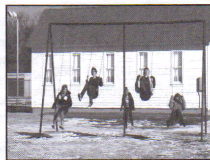
The scouts enjoy 'recess' by the schoolhouse.