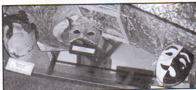
Masks created by high school art students.

Museum volunteers will host a reception for the student artists on