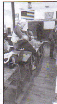
Lessons in the old schoolhouse.