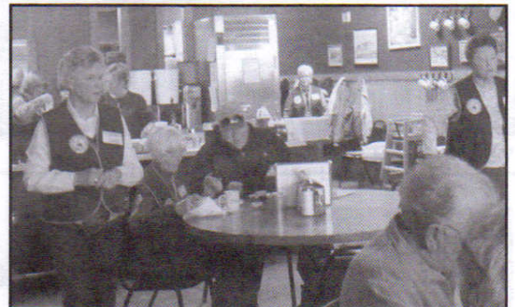
Large crowds of customers keep the volunteers busy throughout the evening.