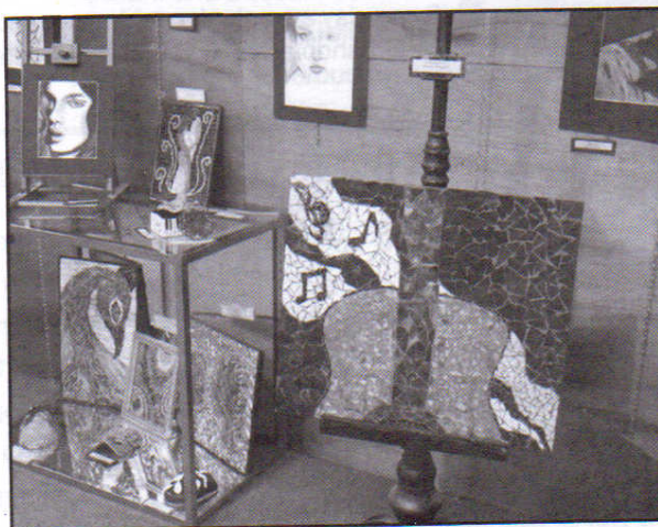
A sampling of the high school students artwork.