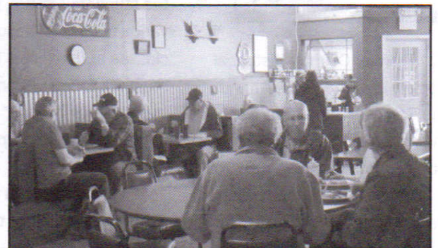
Guests enjoy the pancakes and sausage at the Okie Cafe.